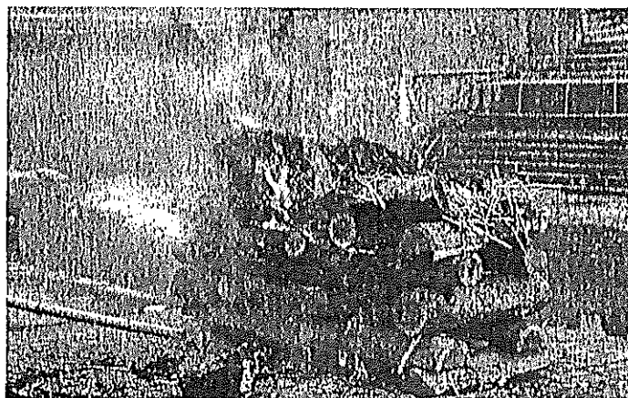
Fig. 1. Cremation at Pashupatinath

The preparation of the flesh of the body is the essence in the funeral rite because of the dual function of death; the individual's destiny and the future of society. It involves soteriology at two levels. Without ethicisation of death and the flesh for further life, the process of ethicisation step 1 would not have turned into ethicisation step 2. A karma ideology necessitates more than just individual punishments and rewards since humans are miniature replicas of the gods. Therefore, the divine will and cosmic battles in Kali yuga have to be incorporated into this system, and the transformation of flesh into life-giving waters or energies is the most important part in death rituals. Providing society with the life-giving water is the primordial task for the gods. It is the best soteriology possible on earth; the perfect and eternal salvation is in heaven.